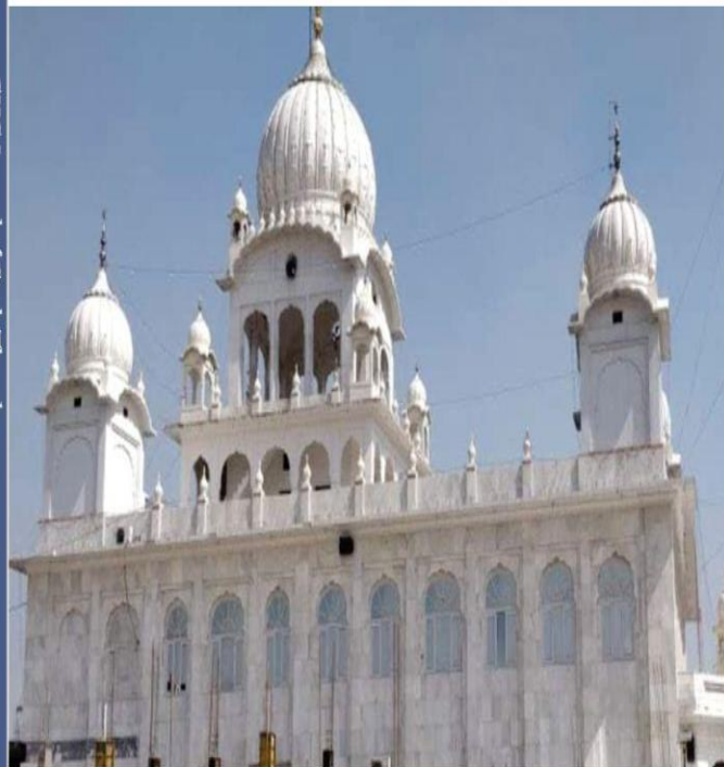
Gurdwara Sis Ganj Sahib, Delhi