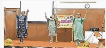
ਖਾਲਸਾ ਕਾਲਜ ਵਿਖੇ ਸਮਾਜਿਕ ਏਕਤਾ ਡਾਸ ਕਰਦੀਆਂ ਵਿਦਿਆਰਥਣਾਂ।